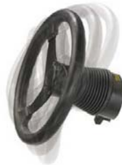
Tilt option available